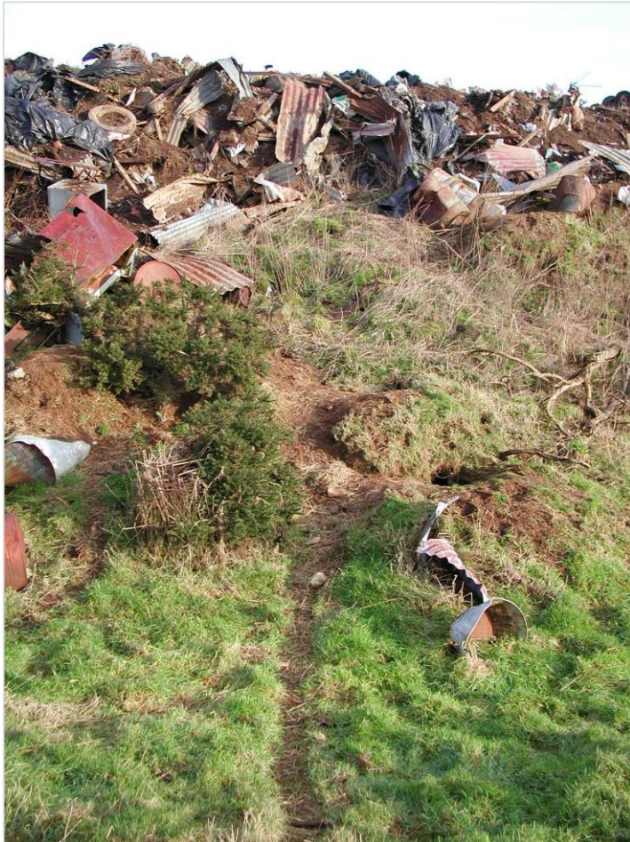
Figure 1 Rubbish dumped on a badger's sett

1.1 Wildlife crime is a serious problem in Scotland. Despite our reputation as a country at the international forefront in protecting the natural environment; a country where people love and care deeply for our spectacular, varied and beautiful wildlife and habitats, certain categories of our wildlife are regularly persecuted and killed – to the point where entire species are threatened with extinction, or left in an unsustainable state. This situation (with regard to bird of prey persecution) was described as “a national disgrace” by First Minister, Donald Dewar MSP (1998 Vane Farm speech) and it undermines our reputation as a modern country.