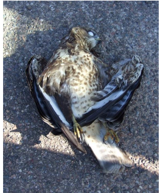
Figure 2 This shot Buzzard was found in the back of a gamekeepers Land Rover.

With a few notable exceptions, the report paints a less than flattering picture of the efforts of the public agencies to tackle these crimes. It highlights instances of a lack of resources, commitment and experience; procedural difficulties; inconsistent recording of data, communication failures; obstructiveness; and failures to fully utilise available expertise.