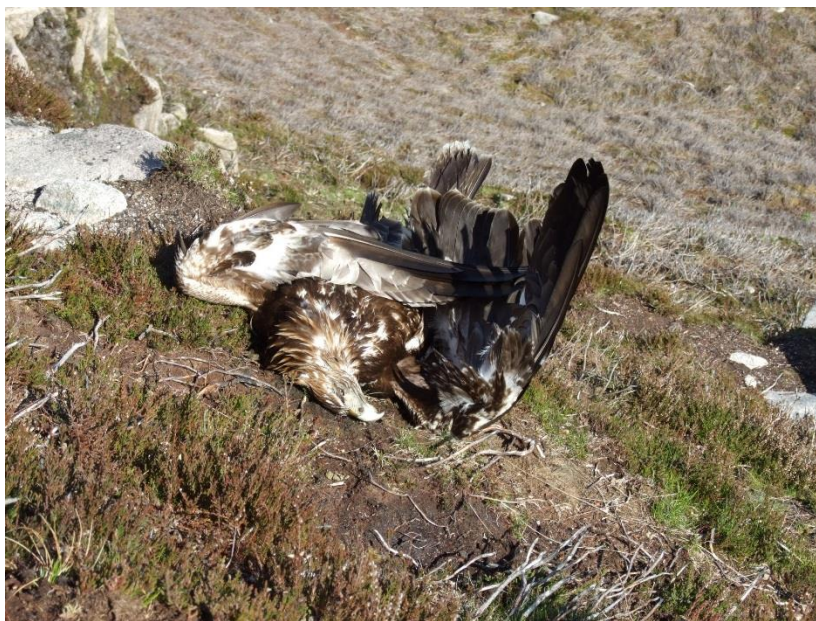
Figure 3 Poisoned Golden Eagle, Skibo, May 2010

A considerable number of peer-reviewed scientific studies have demonstrated that the abundance and range of many of the main species which are the target of wildlife crimes are hugely constrained in Scotland. Assessments of the causes of these lower abundance figures are made by using population modelling techniques, including known mortality levels. The results are often devastating. Wildlife crime is the most serious threat to many of our rare and iconic species.